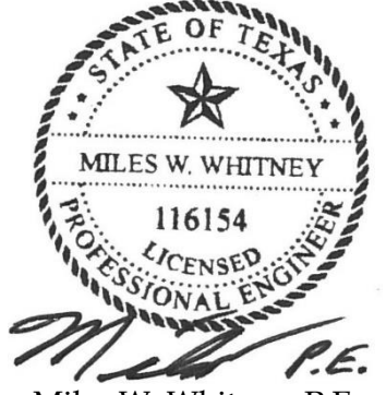
Miles W. Whitney, P.E. Note: All dates are approximate and subject to change.